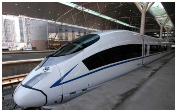
CRH3 high speed train