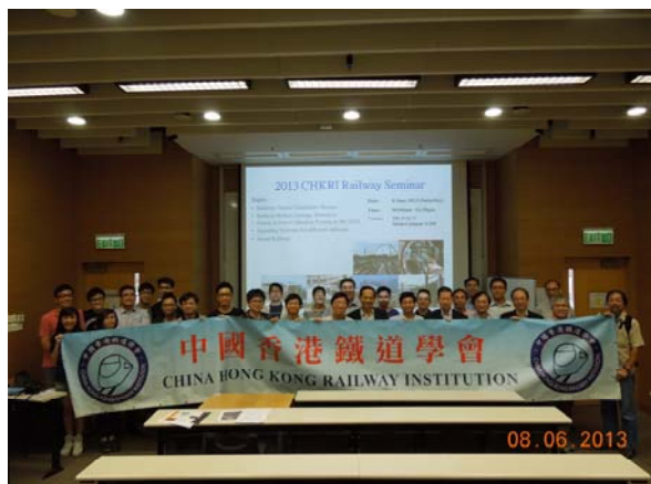
CHKRI Railway Seminar with Tertiary Institutions

The first-ever seminar with tertiary institutions was held on 8 June and attracted 58 participants. More than half were recent graduates and non-members. Speakers from industry, universities and CHKRI covered different aspects of railway engineering from trackwork, signaling, automatic fare collection, tunnel ventilation to academic research projects.