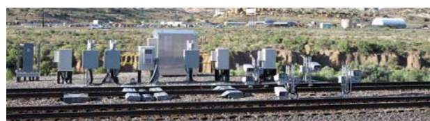
Beena Vision monitoring systems