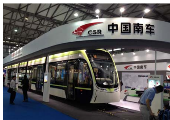
China Urban Mass Transit Forum 2014 and the Rail + Metro China Exhibition 2014