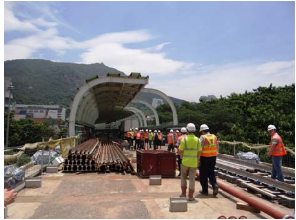
Members visit the construction at Ocean Park

On 14 June, members had a unique opportunity to visit the construction which includes a number of “firsts” in Hong Kong, namely that non-ballasted trackforms will fully cover the depot area and the overhead line system will be integrated with noise barriers such that OHL masts are not required on the viaduct section